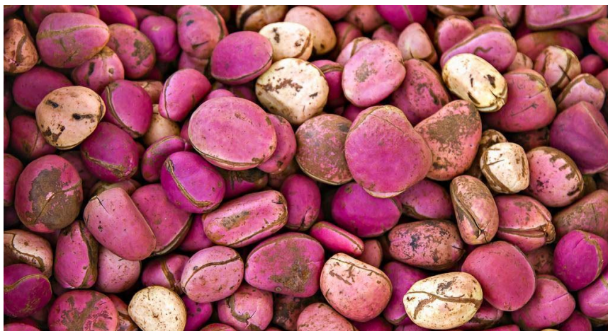
Fig. 1. Showing the Cola nitida (Available)

(1.9 million cases, 9.6%), prostate cancer (1.5 million cases, 7.3%), stomach cancer (970,000 cases, 4.9%), and female breast cancer (2.3 million cases, 11.6%) [3,5]. Surgery, chemotherapy, and radiation therapy are common methods of treating cancer. However, newer treatments like immunotherapy, stem cell therapy, and gene therapy including CAR-T cell therapy are also gaining popularity [6]. Anticancer drugs work by preventing the growth and death of malignant cells while causing the least amount of damage to healthy cells. This is accomplished by processes such as immune response activation, tumor suppression, apoptosis induction, and immune system detection of cancer cells [7,8]. Certain naturally occurring substances, such as those originating from plants, initiate and promote these processes, controlling the growth of cancer cells via a variety of methods. The perennial plant known as Cola nitida is grown mainly for its seeds, which are eaten for their stimulating properties and are used in traditional ceremonies across West Africa [9]. Cola nitida is a member