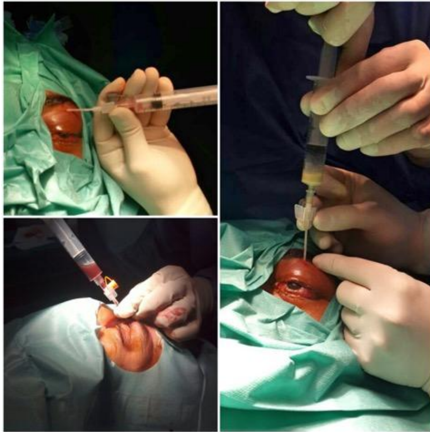
Fig. 3. Drainage of the abscess