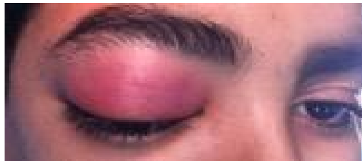
Fig. 1. Subperiosteal abscess of the right eye

The CT scan is a very important mean to decide on the surgical drainage of the orbital collection. On the CT scan the abscess appears as a homogenous or heterogeneous image surrounded by an enhanced hyperdense shell , while the presence of a sinusal liquid-air level indicate the sinusal origins of this. The medial displacement of the interne rectus muscle as well as the displacement of the periosteum away from the papyraceous slide is other characteristics of the abscess, this helps making a precise evaluation of the intra orbital lesions as well as exploring the bone and sinus lesions, and searching for possible cerebral complications. [13,14,15,16].