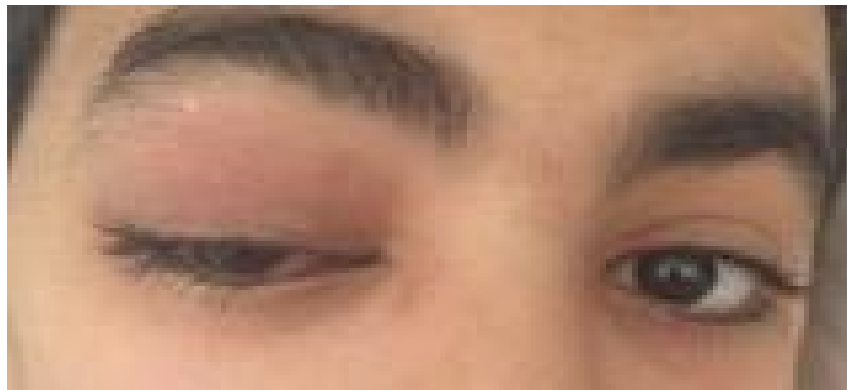
Fig. 4. Post drainage aspect

The surgical drainage, guided by the clinical and imaging data should concern the orbital abscess, by orbitotomy or an endonasal intervention as well as all infected sinusitis.