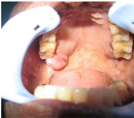
Fig. 5. Marked reduction in intraoral maxillary swelling

The reported prevalence of brown tumours is 0.1% [9]. Primary hyperparathyroidism in 80% of the cases is due to a parathyroid adenoma; in over 15% of the cases it is due to a glandular hyperplasia, and extremely rare due to a parathyroid adenocarcinoma [10].