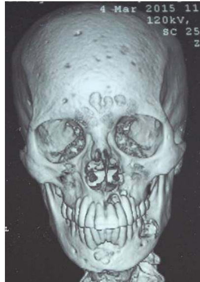
Fig 2. 3-D computed tomography showing

The following treatment was planned – parathyroidectomy, follow-up of around 1 year and excision and curettage of the maxillo-mandibular swellings.