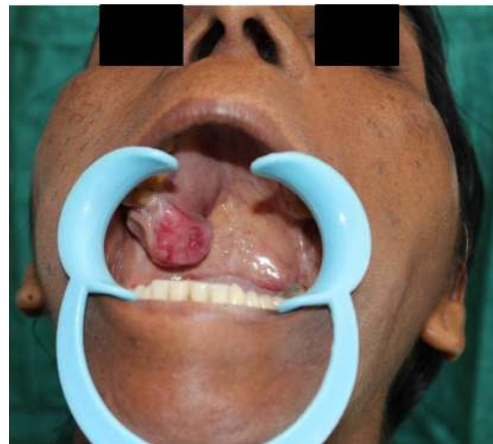
Fig. 1. Ovoid, sessile swelling in the right maxillary posterior alveolus

Upper right second molar was buccally displaced and grade II mobility in relation to 15, 16, 17. Teeth associated with the swelling were non-carious and vital.