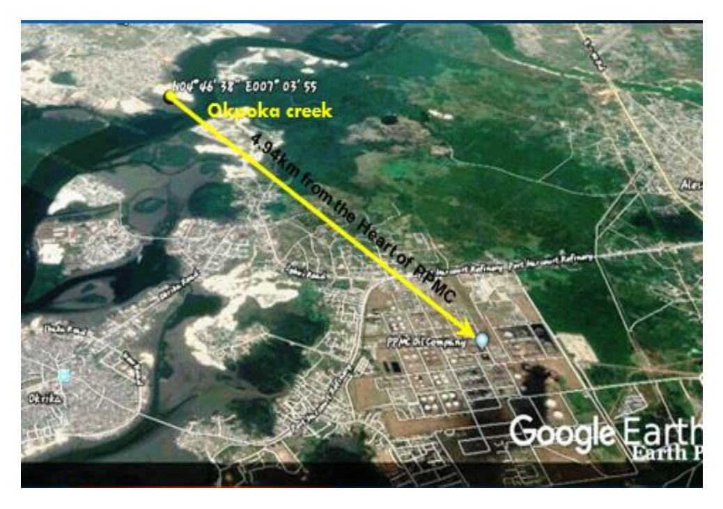
Fig. 2. Study Site Okpoka Creek is 4.94km from the Heart of PPMC Oil Company