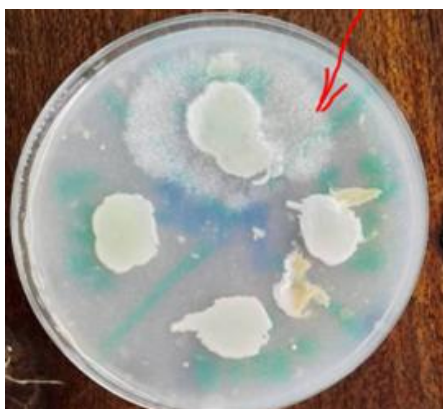
Fig. 1. Positive hydrolytic enzyme activity

No esterase activity was detected among our isolates. On the other hand, proteinase and phospholipase activities were demonstrated as seen in Fig. 1.