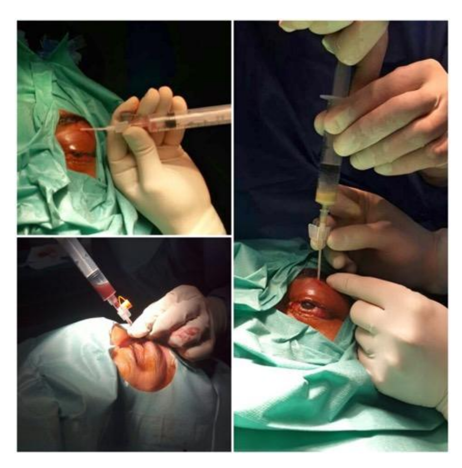
Fig. 3. Drainage of the abscess