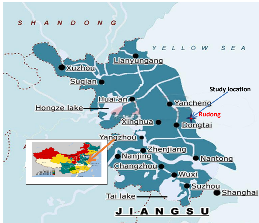
Fig. 1. Study area

Data Envelopment Analysis (DEA) deals with the use of linear programming methodology to measure the relative performance of organization units and efficiency of multiple decision-making units (DMU) when the production procedure provides a multiple of inputs and outputs that make comparisons difficult. [13] who built up the efficient frontier term known as Data Envelopment Analysis (DEA). Since then, there has been several studies that have used the DEA method. [13] suggested a model that could provide input orientation and estimate the constant return to scale (CRS).