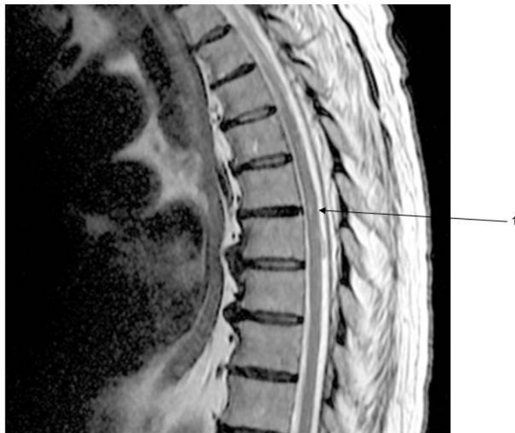
Fig. 2. MRT T 2 sagittal section 1- Ischemic lesion